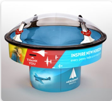
Visitor donation boxes. Design, artwork, mock ups.