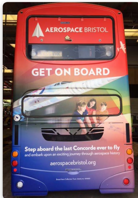
Bus advertising .